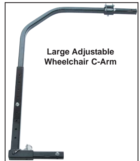
Large Adjustable Wheelchair C-Arm